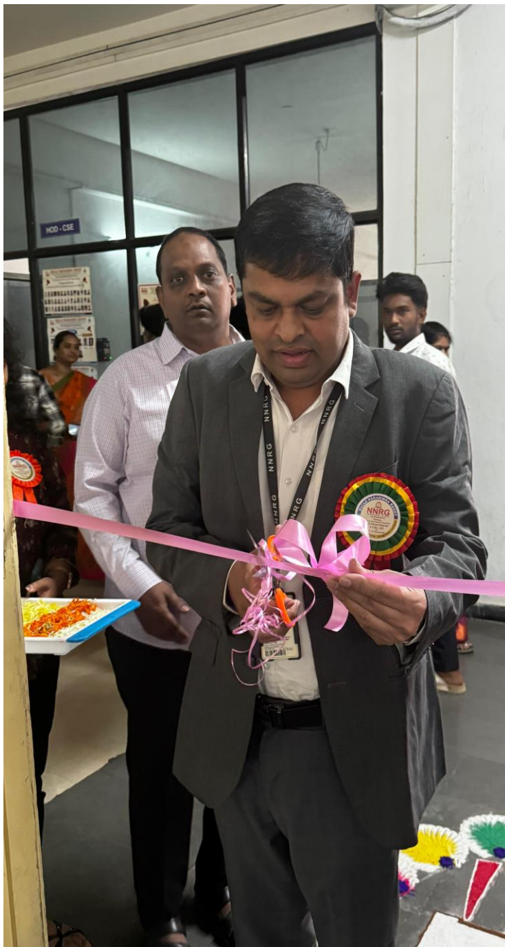
Inauguration of the Event by the Head of the Department